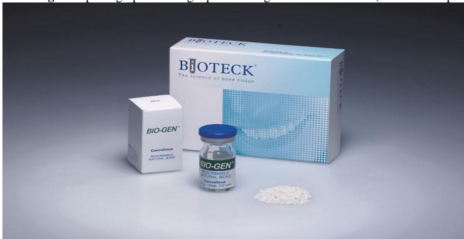
Fig 1:- A photograph showing equine Xenograft bone substitute (BIO-GEN® product).

(OFD) and (Study site): included fifteen periodontal intrabony defects which were treated with OFD with bone graft material (BIO-GEN MIX Granules) [Figure 1].