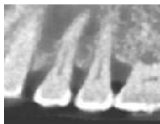
6 Months postoperatively

The ultimate goal of periodontal therapy is the regeneration of periodontal supporting tissues that have been lost as a consequence of periodontitis. The key to tissue regeneration is to stimulate a cascade of healing events which, if coordinated, can result in completion of integrated tissue formation. The various treatment modalities include the