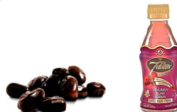
Figure 1. Sayer dates and 7dates

12 gr/dL (see table 1), having one or more symptoms of anemia, not consuming any iron supplements, and a willingness to consume either iron tablets, dates or 7dates. The exclusion criteria were girls with excess iron (hemocromatosis, hemosiderosis), anemia due to red-cell fragmentation (hemolytic anemia), disorders of red blood cells (porphyria, thalassemia), stomach ulceration (peptic ulceration) and colon ulceration (ulcerative colitis), alcohol drinkers and recipients of routine blood transfusions.