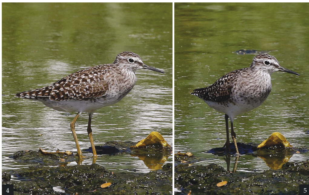
Figures 4–5. Adult Wood Sandpiper Tringa glareola , Fernando de Noronha, Pernambuco, Brazil, March 2018; note the long bold white supercilium (reaching well behind the eye), boldly checkered upperparts, long yellowish-green legs, and prominently marked upper breast

South and South-East Asia, the Philippines, Indonesia, New Guinea and Australia (van Gils et al. 2019).