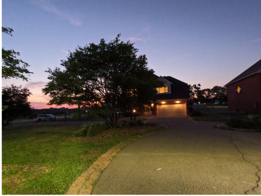
A Slope of fitted line = -0.20