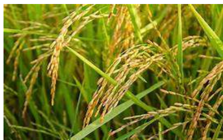
Fig:8. Rice ( oryza sativa )

A research in 2007 found that transgenic rice ( Oryza sativa ) plants expressing the B subunit of E. coli induces significant number of antibodies to this subunit. In the same year, an immune response was found to be caused in chicken by transgenic rice that is a result of the VP2 antigenic protein from infectious bursitis.[9]