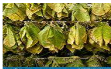
Fig:4. Tomato & tobacco