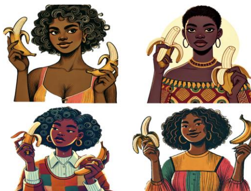
Figure 1 : Exhaustive & Atomic Distributivity Scenario

Exhaustive distributivity means that the predicate must apply to all individuals in the domain, without exception. In the example ‘ each woman held two bananas ’, illustrated in Figure 1 below, this implies that every woman involved in the event satisfies the condition of ‘ holding two bananas ’. Atomic distributivity, on the other hand, requires that distribution applies to minimal individual entities rather than to subgroups. Thus, in the same example, the interpretation is computed woman by woman , rather than by groups of women collectively holding two bananas .