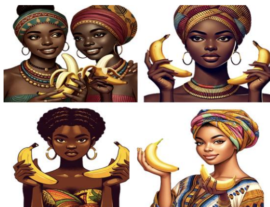
Figure 3: Non-atomic distribution scenario

A non-atomic distribution scenario is illustrated in Figure 3 below. In this scenario, the object ‘two bananas’ is not distributed to each atom (each woman), because there is a case where two bananas are held collectively by two women, rather than two bananas for each individual woman.