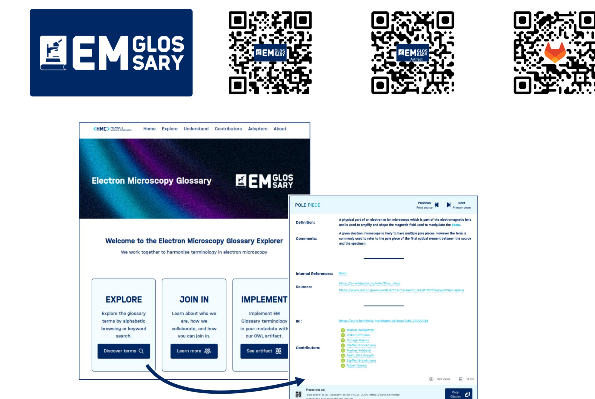
Screenshots from EM Glossary Web Explorer taken in Q1-2025

Interested in electron microscopy? Join our community glossary and meet others in the field, integrate our OWL artifact, or browse our web explorer.