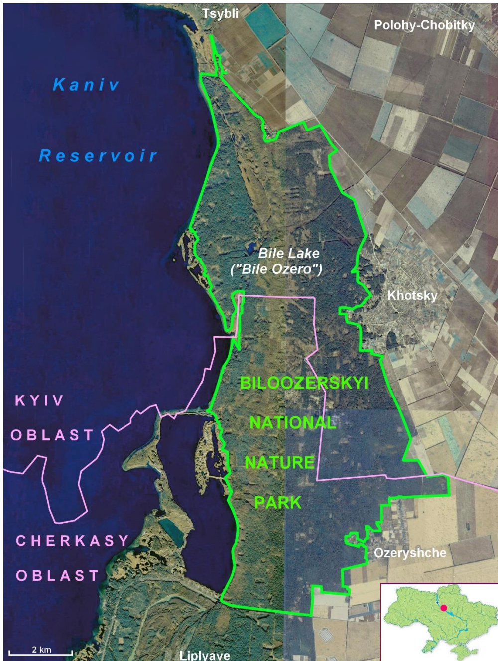
Fig. 1 Location and boundaries of the Biloozerskyi National Nature Park.

J. Paczoski (1894) of the vegetation around Pereiaslav town, located 14 km northwest of the Park. Among other observations, this author described a pine forest that has been preserved about 3 km northwest of the Park. He noted the remarkable diversity of the flora, as a relatively small area contained a significant number of