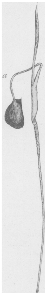
FIG. 3.—Older seedling of Yucca angustifolia .

WEST VIRGINIA UNIVERSITY. Morgantown, W. Va.