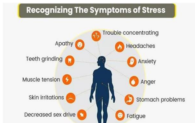
[Fig.1: Symptoms of Stress and Affect Body]