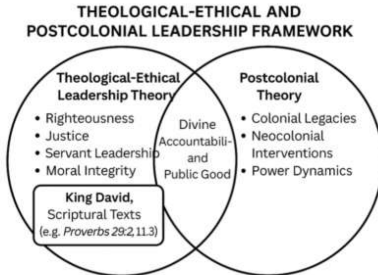
Figure 1: Theological-Ethical and Postcolonial Leadership Theoretical Framework

This study employed a hybrid theoretical framework that combined Theological Ethical Leadership Theory with Postcolonial Theory to analyze Africa's governance crisis. The Theological Ethical Leadership framework drew on scriptural values such as righteousness, justice, humility, and moral integrity, exemplified by biblical figures like King David. Citing Proverbs 29:2 and 11:3, it underscored the societal well-being that resulted from righteous rule and contrasted it with the destructive effects of corrupt governance. It framed leadership as a moral and spiritual calling that placed divine accountability and selfless service above personal or political gain. Scholars highlighted the role of biblical ethics in shaping leadership that reflected divine justice and integrity, fostered public trust, and counteracted political corruption (Sanou, 2021; Dawson, 2024; Okoye, 2025). Integrity and transparency were not only ethical virtues but also essential strategies for effective leadership, as they built trust, strengthened institutional credibility, encouraged ethical conduct, empowered teams, and improved decision-making (Gaylord, 2024).