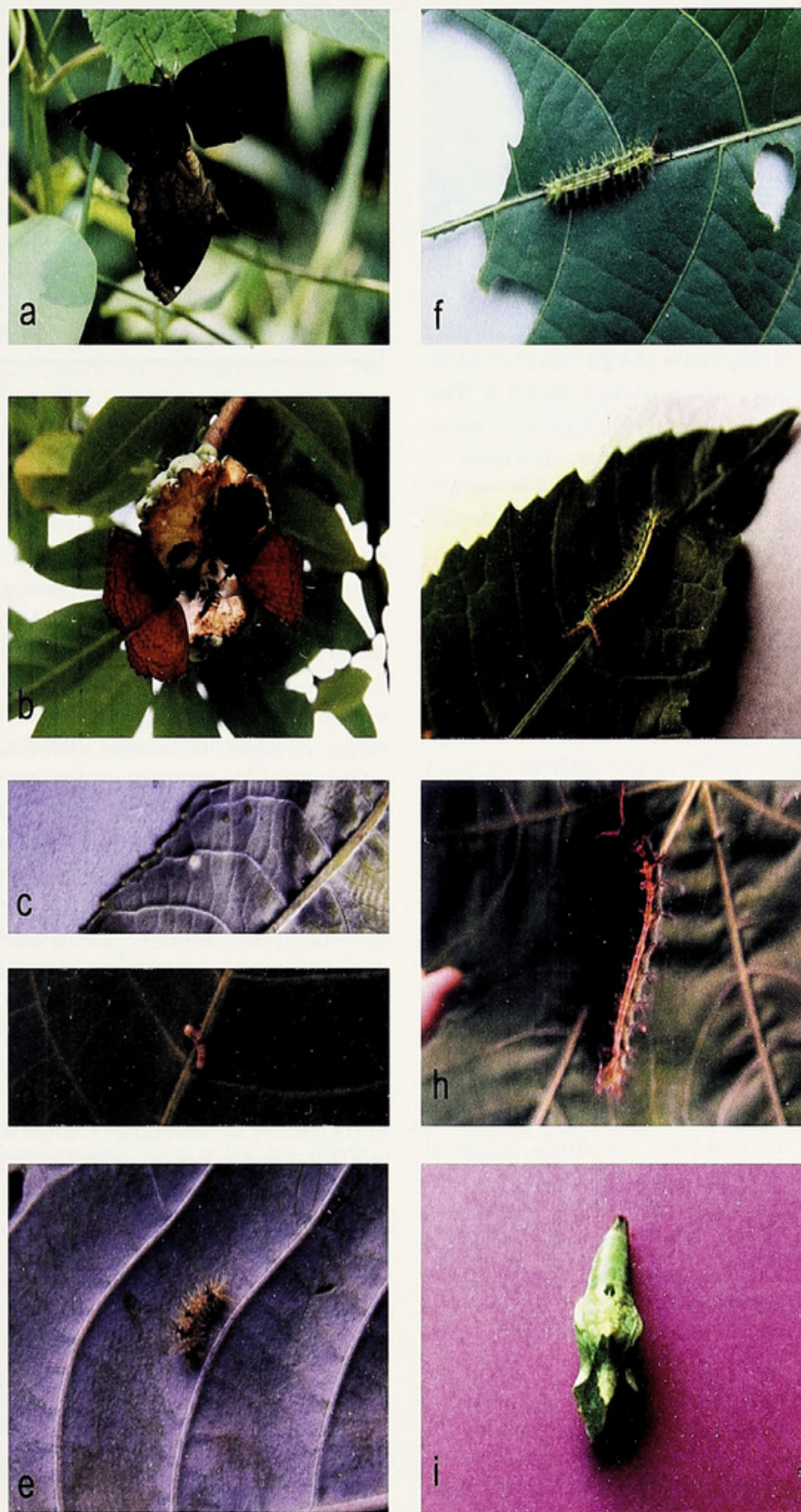
Figure 1. Photographs of the sequential stages in the life history of Ariadne merione merione . a) Adult pairing. b) Adults feeding on the damaged fruits of Annona squamosa . c) Egg. d) Instar I. e) Instar II. f) Instar III. g) Instar IV. h) Instar V. i) Pupa.