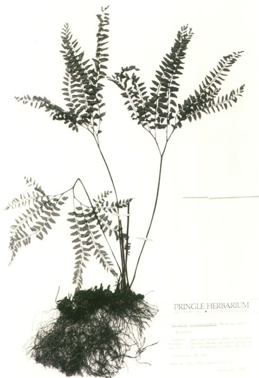
Figure 2. Holotype of Adiantum viridimontanum (Belvidere Mountain, Eden, Vermont, 28 August, 1985, Paris 856 (vr)).

atropurpureous, lustrous, 2.0–3.0 mm diam., with a single, gutter-shaped vascular bundle, petiole scales similar to the rhizome scales but more or less spreading, tortuous, fugacious except at petiole base; blades flabellate in shade to funnel-shaped in full sun (flattened in pressed specimens), pseudopetate, 10\text{--}35 \times 10\text{--}