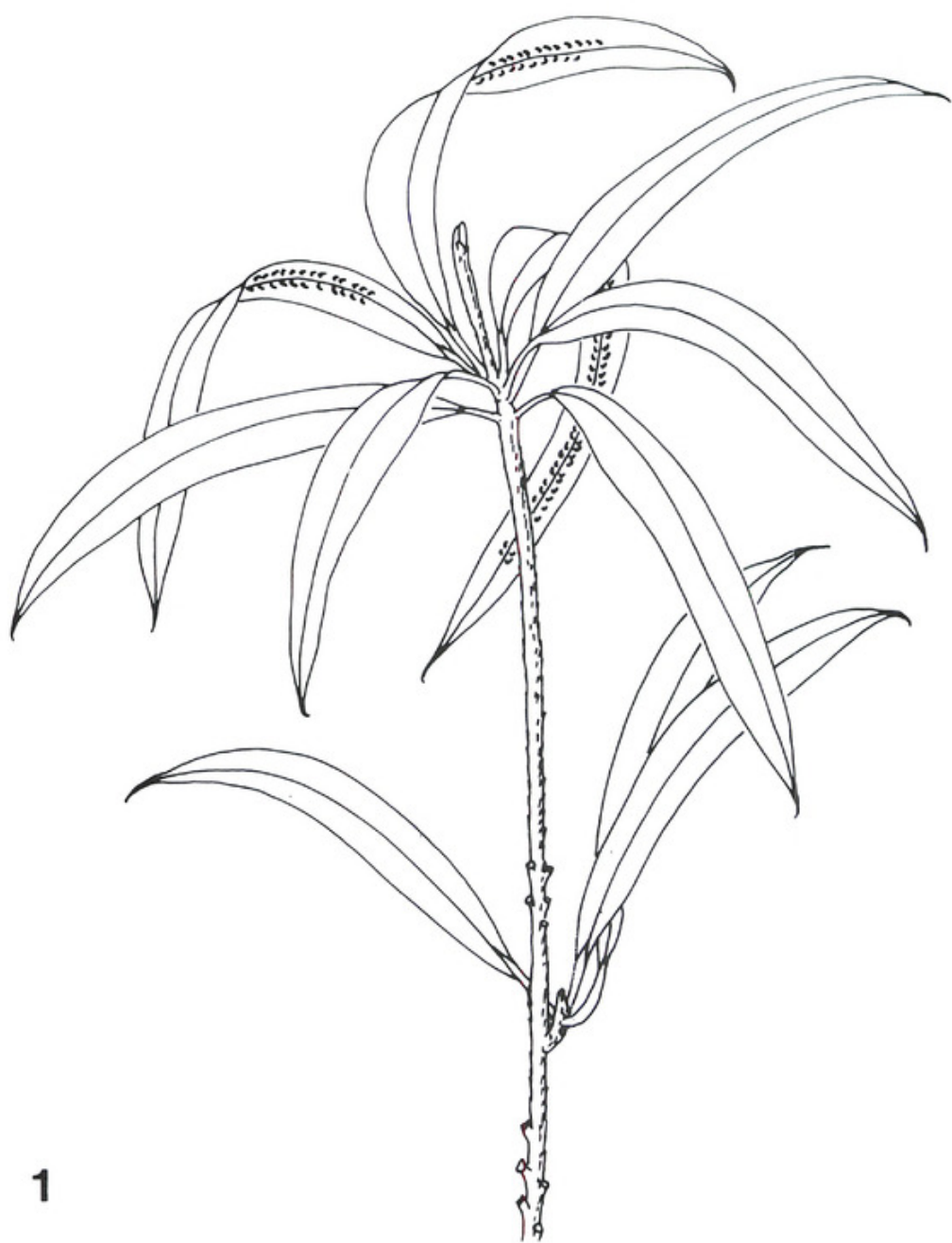
Figure 1. Habit of Oleandra neriiformis , terminal portion of erect stem, \times ca. 1/4, adapted from Kalkman 4005 (A), New Guinea.

Christensen (1937) published on the original material at Madrid. This is the most abundant and most widely distributed species among those treated. Distinctive characters are the radially symmetrical aerial stem, the monomorphic leaves, and the sori that are borne away from the margin. Merrill (1918) and Price (1973)