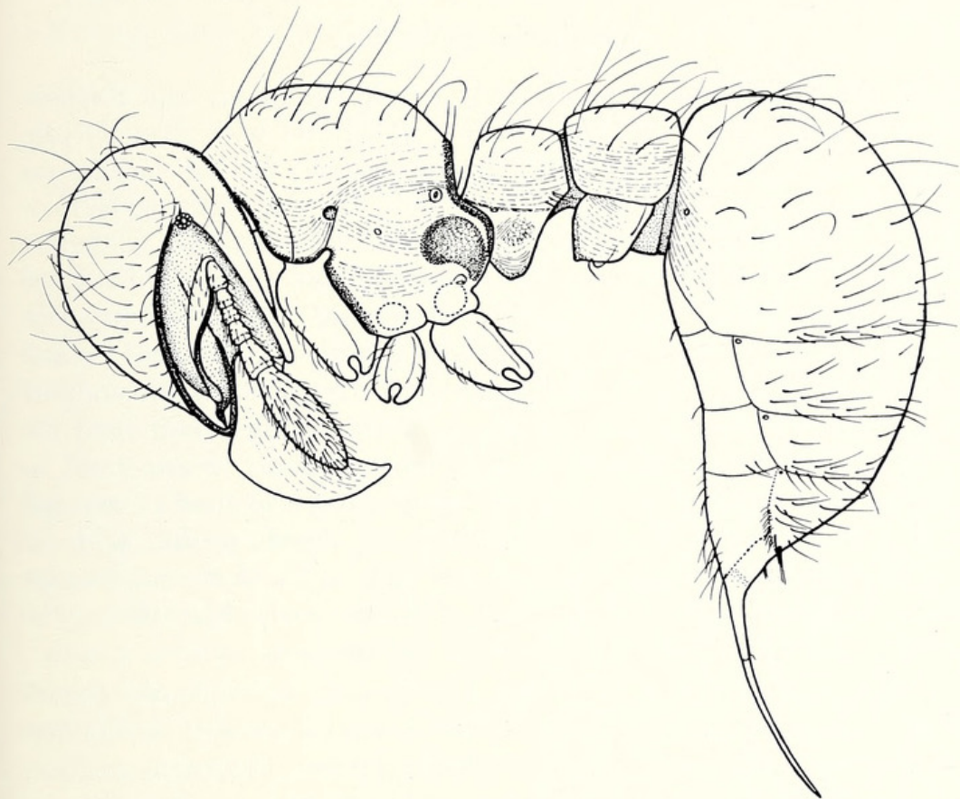
Figure 1. Tatuidris tatusia gen. et sp. nov., holotype worker in side view.

The tribe Agroecomymecini occupies a basal position in subfamily Myrmicinae, and in fact it may well represent the relicts of the primitive stock connecting the Myrmicinae to the ancestral tribe Ectatommini in subfamily Ponerinae, as already proposed by Brown (1954). Like Myrmica and allies among the lower Myrmicinae, the Agroecomymecini have pectinate spurs on the last two pairs of