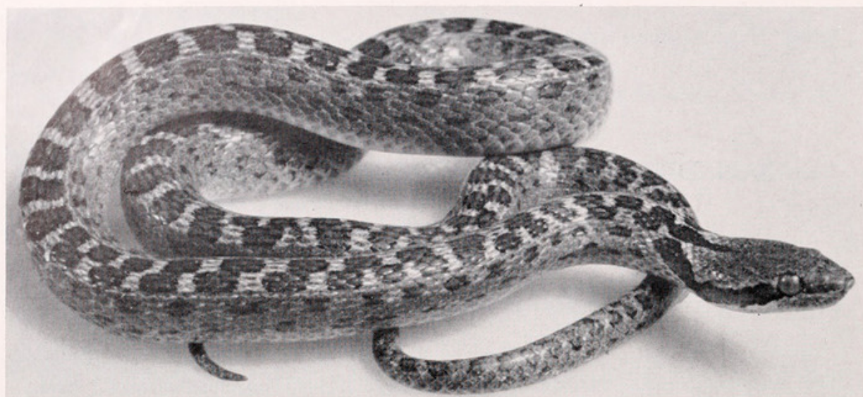
Fig. 1. The type specimen (SDSNH 44680) of Hypsiglena torquata catalinae .