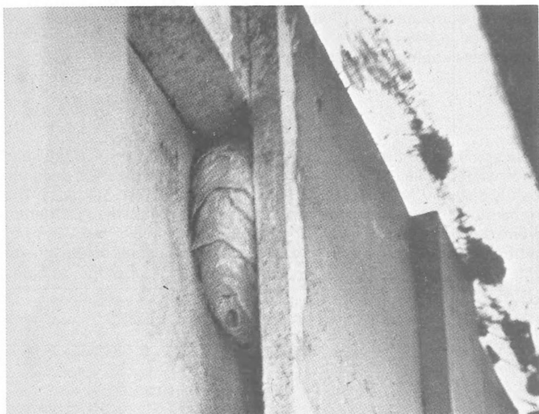
Figure 1. A nest of Dolichovespula saxonica (F.) in situ in a building wall void at King's Mountain, Alaska. Siding had been removed to expose the nest.