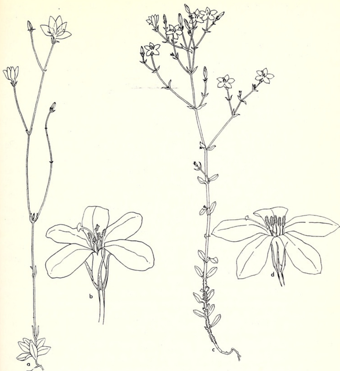
FIG. 1. Centaurium gentryi , a. habit (x0.5), b. flower (x1.2)—based on Gentry 8035; and C. pterocaule , c. habit (x0.3), d. flower (x1.2)—based on Smith M81.

Centaurium pterocaule Broome, sp. nov. Herba annua, caule erecto alato, floribus paucis pentameris magnis, lobis corollae tubo longioribus. Centaurio chironioide affinis, caule et videtur simplici, alis usque ad 1 mm latis, undulatis, foliis inferioribus obovatis latioribus differt. Fig. 1c, d.