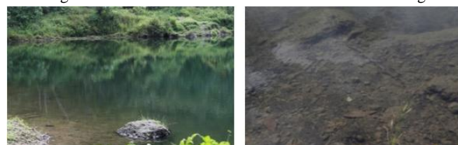
Figure 4 Cleanliness of Water and Environment of Wae Ela Lake

Cleanliness of water and environment is very important to support tourism activities. For nature tourism, Lake Wae Ela is very important to maintain the beauty and sustainability of its ecosystem. The cleanliness of the water in Lake Wae Ela is seen from the absence of pollution caused by domestic waste, industry, and other human activities. On the edge of the lake, the clarity of the lake water is visible, in addition there is no shallowing, and vandalism, such as graffiti or scribbles that can damage the aesthetic and ecological value of Lake Wae Ela. (Pangestu & Indrawati, 2021; Sidabutar & Hidayat, 2023; Syabina et al., 2024) that environmental cleanliness supported by minimal human influence is an important factor in the success of tourism and encourages tourist visits and increases satisfaction in traveling.