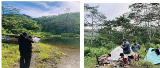
Figure 6 Bird Watching and Camping Activities

The high flora and fauna in the lake environment is an attraction for tourists who want to observe animals and plants directly. This opinion is in line with the opinion of (Budiatiningsih et al., 2023) , that various nature activities such as studying biodiversity, as well as enjoying tourist areas that still look very beautiful and natural. In addition, camping activities are also in great demand by tourists, especially young people, camping around the lake also provides an opportunity for tourists to feel close to nature.