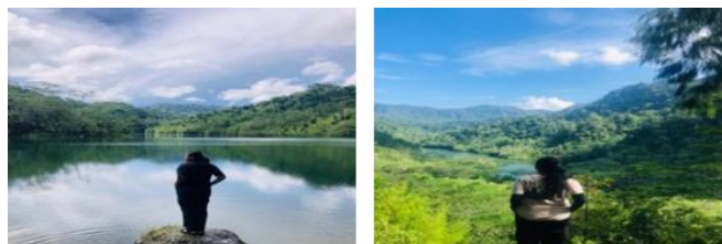
Figure 3 Natural Beauty of Wae Ela Lake

Beauty is one of the attractions that has value so that it can attract the attention of visitors to visit the object. Wae Ela Lake has a beauty that can attract visitors for holiday purposes. The view of Wae Ela Lake is surrounded by tropical vegetation and towering hills, creating a calm and soothing atmosphere. From the surface of the lake, we can see the reflection of the trees and the blue sky above the clear water, creating a beautiful view, accompanied by distinctive natural sounds such as the sound of birds chirping, the sound of gurgling water and the sound of leaves produced by the movement of leaves also add to the beauty. (Fitri et al., 2025) argue that the environment around the lake surrounded by tropical forests can add a natural and beautiful impression and is supported by views of green hills and distinctive natural sounds can add to the aesthetic value of the lake.