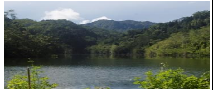
Figure 2 Wae Ela Lake

Wae Ela Lake has quite large natural tourism potential as a leading tourist destination in the Maluku region. Wae Ela Lake visually has a stunning natural view with its naturalness and beauty as seen in the following image.