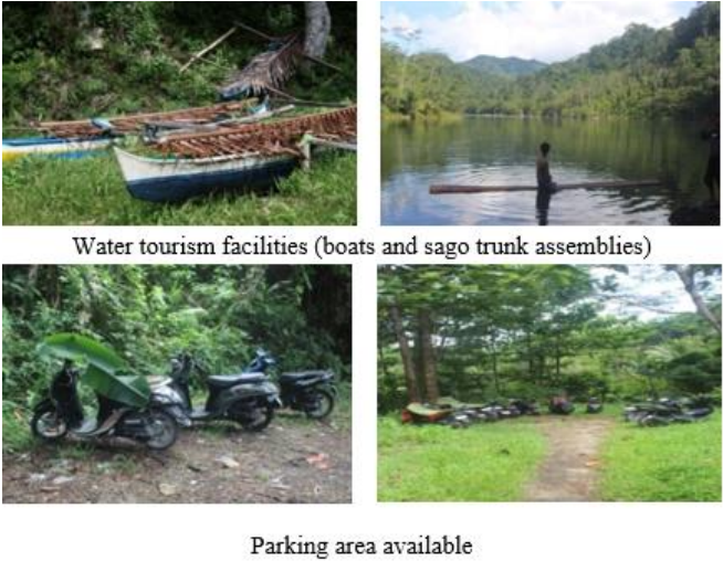
Figure 7Facilities and Infrastructure at Wae Ela Lake

In the development of tourism, sufficient supporting infrastructure such as roads, water installations, electricity, clean water, accommodation and others, can provide satisfaction for visitors because in general tourists do not only come to enjoy the attractions but also want to enjoy the existing facilities (Yuniarti et al., 2018) . The infrastructure available at Lake Wae Ela is a parking area and roads. The parking area is available, but it does not meet the expected standards, such as the lack of security in the area, and comfort in terms of the shade used. Currently, the parking area is just an empty lot cleared of grass. Meanwhile, for the road to the object, there are collector roads or district roads, local roads or domestic roads and environmental roads referring to the farm roads that tourists usually use to reach the object's parking area.