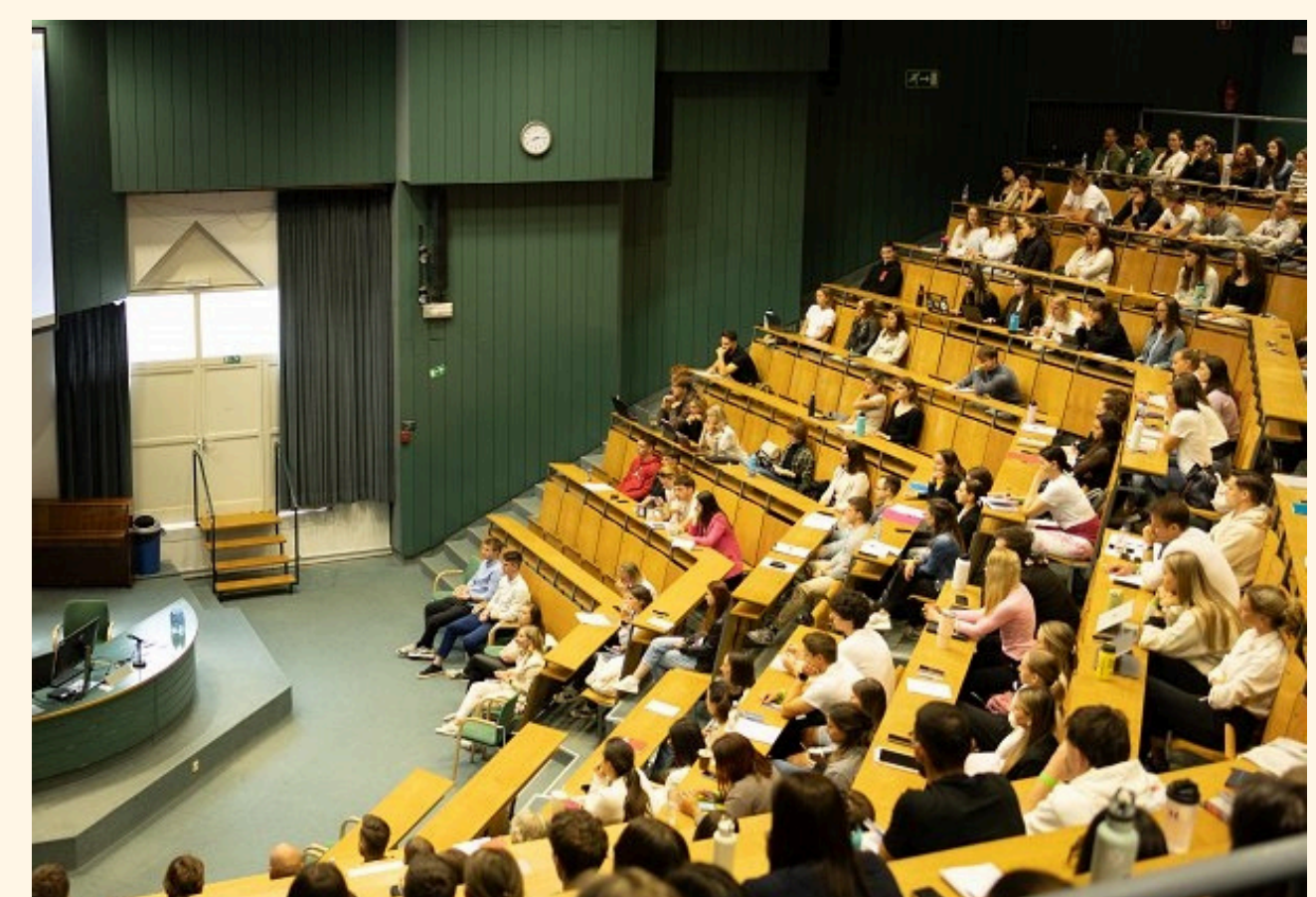
Raising-awareness event organised at UL