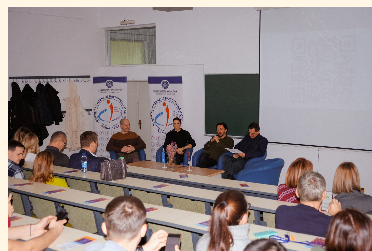
Sport without violence: prevention and support event organised to raise awareness about the guidelines