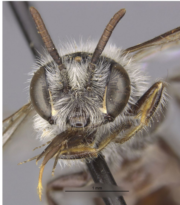
Fig. 1 Headshot of Nomadopsis puellae (Cockerell, 1933) specimen MCZ:Ent:17219, used with permission from the Museum of Comparative Zoology, Harvard University, ©President and Fellows of Harvard CC-BY-NC-SA 4.0. The image was not modified from its original form. The image has the SHA-256 content signature hash: // sha256/edde5b2b45961e356f27b81a3aa51584de4761ad9fa678c4b9fa3230808ea356. A signed citation for this image is provided in example 1.

image from example 1, and the SHA-256 algorithm was used to generate the 256-bit hash that is encoded in the content signature as a 64-character hexadecimal sequence (each character representing 4 bits).