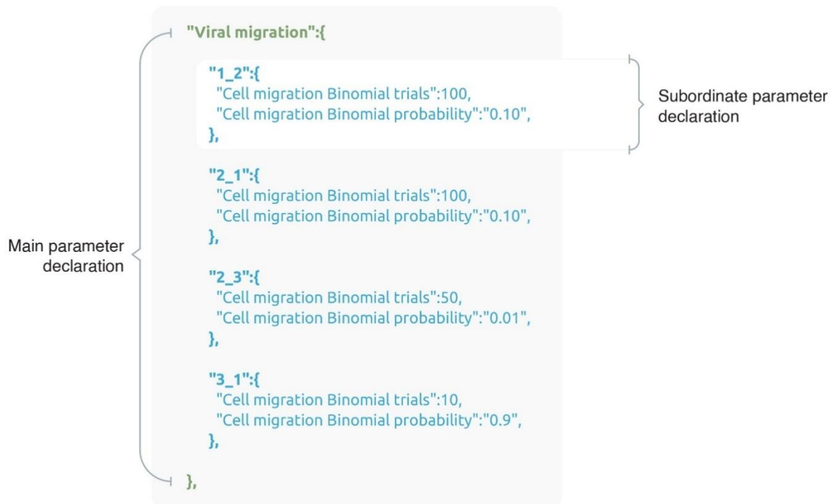
Figure S - 3: Example of a nested parameter declaration. As shown “Viral migration” is the main parameter declaration. The user has then within its scope declared the different tissue to tissue migrations that occur. For instance, in the first subordinate parameter declaration viral particles migrate from Tissue 1 to Tissue 2 (indicated by 1_2) under a binomial distribution ( 100, 0.10 ).

As shown in the Figure S - 3 the main parameter (“Viral migration”) is first declared and following the colon (:) we open curly braces ({} to define the scope of the parameter. Any parameter that falls between the curly braces ({} of the main parameter are subordinate parameters of that parameter. By the end of this 3.3.7 sub section we will learn how to declare such parameters.