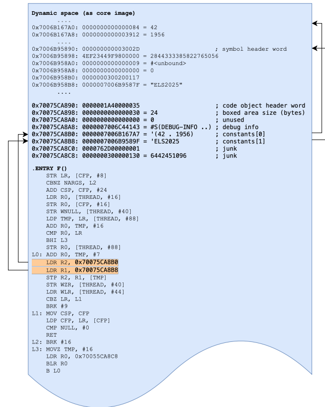
Figure 3: Representation of the compiled code object (in boldface) for the function #'f in memory, along with the cons and symbol objects it references.

Notably, the code object contains both executable machine code and absolute pointers to Lisp objects. Because the machine instructions are to be executed by the CPU, the pages the code object is allocated on must be marked executable by the runtime.