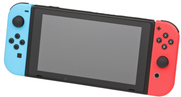
Figure 1: The Nintendo Switch (NX) handheld game console

Charles Zhang and Yukari “Shinmera” Hafner. 2025. Porting the Steel Bank Common Lisp Compiler and Runtime to the Nintendo Switch NX Platform. In Proceedings of the 18th European Lisp Symposium (ELS’25) . ACM, New York, NY, USA, 7 pages. https://doi.org/10.5281/zenodo.15384117