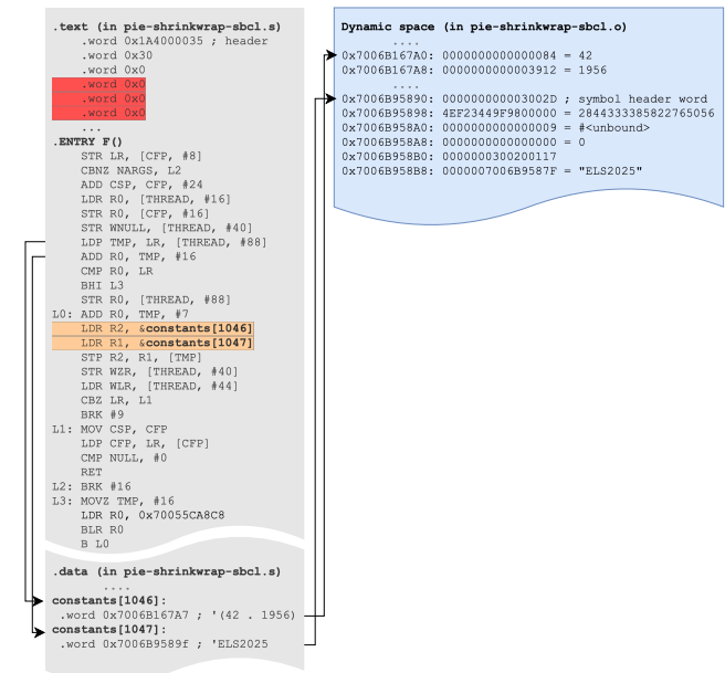
Figure 4: Representation of the same code object and the cons and symbol objects it references after code/data segregation and the rest of the shrinkwrapping process.

constants cannot be fixed up as part of the relocation process on start-up. Furthermore, only the system loader is able to allocate executable pages by loading code from on-disk ELF .text sections, meaning it isn't possible to first fix up boxed object pointers in the code object before marking the code pages executable. In either case, the garbage collector would not be able to fix up these pointers either. Therefore, the code and data need to be separated, at first so that the runtime can relocate the absolute pointers to the Lisp objects, and later so that the moving garbage collector is able to fix up those references. This restriction requires the shrinkwrapping procedure to separate the data from the code and to rewrite the code in the image offline so that any references in code to code constants 1 are into a dislocated read/write space instead of into the code object itself, which is on an executable page and hence not writable on the NX. To demonstrate this process in more detail, our modified offline shrinkwrapping process produces two artefacts from a normal Lisp image: