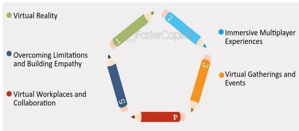
Fig 1: Virtual Reality and Social Interaction Connecting People in New Ways [4]