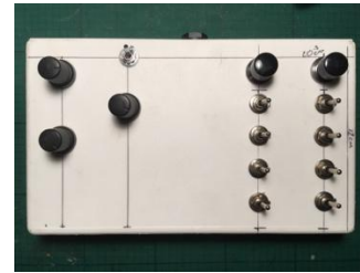
Figure 3 – Interface in VHS Enclosure