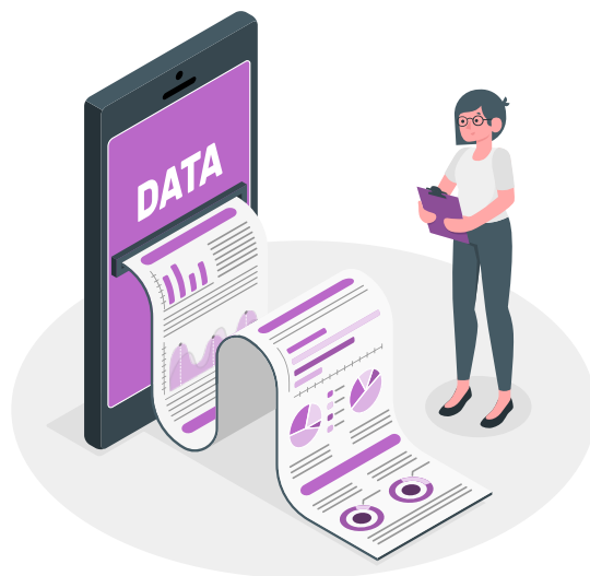
Illustration by Storyset