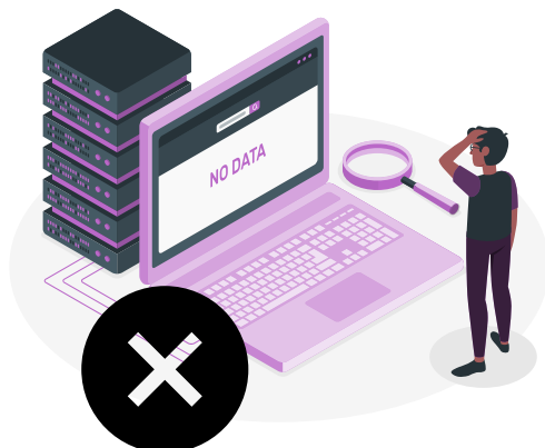
illustration by Storyset