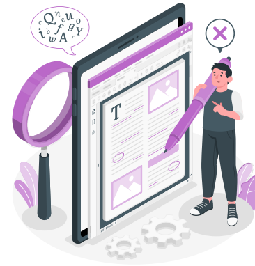
Illustration by Storyset

A few sentences included in the published research article providing information about the availability of the data on which the article is based.