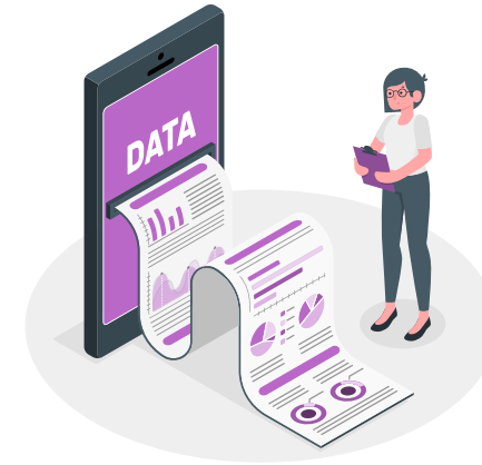
illustration by Storyset