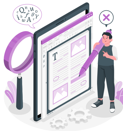
Illustration by Storyset