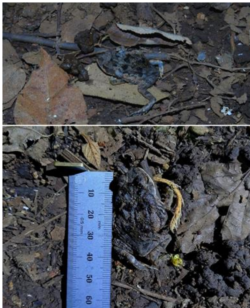
Figure 3. Post mortem state of R. horribilis.