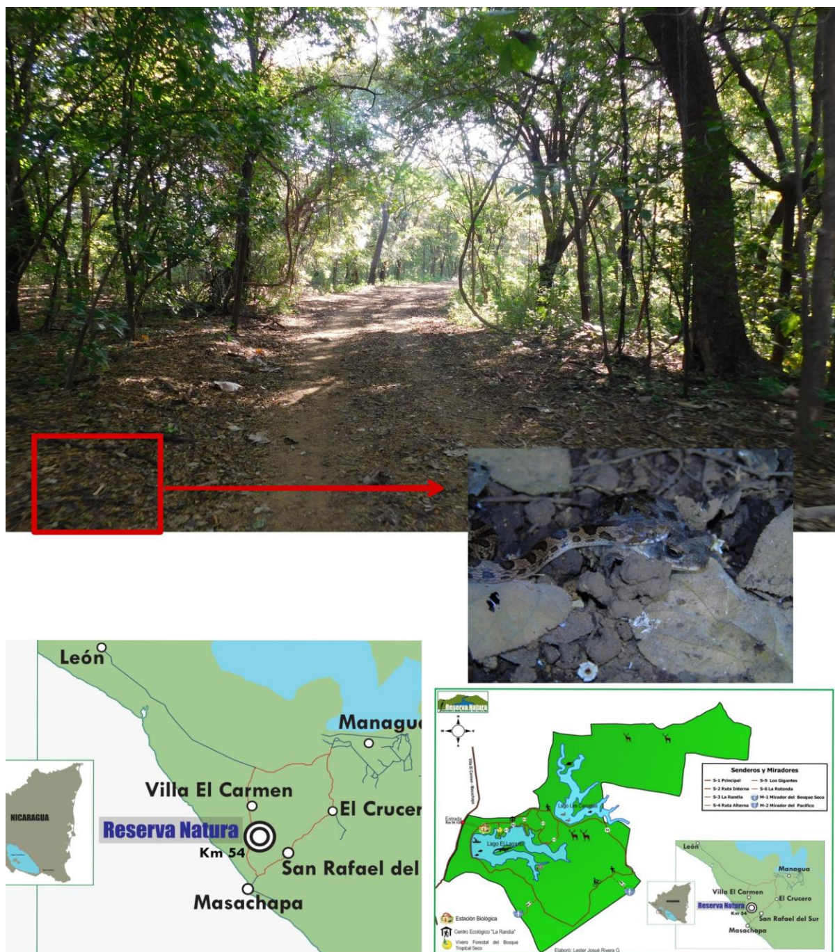
Figure 1. The location where predation took place with macro and micro localization.