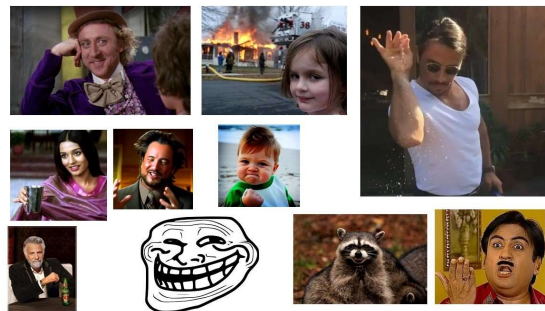
Figure 1. A collage of various famous memes from the internet

Anti-vaxxers and terrorist organizations capitalized on this during the pandemic and started specific memes to increase the spread of the virus. They spread fake news on vaccines by using terms like clotshots, microchips, and 5G and used fearmongering tactics to increase the spread of the virus and cause havoc in developed countries. This led to a loss of lives across the globe (Basch et al., 2021).