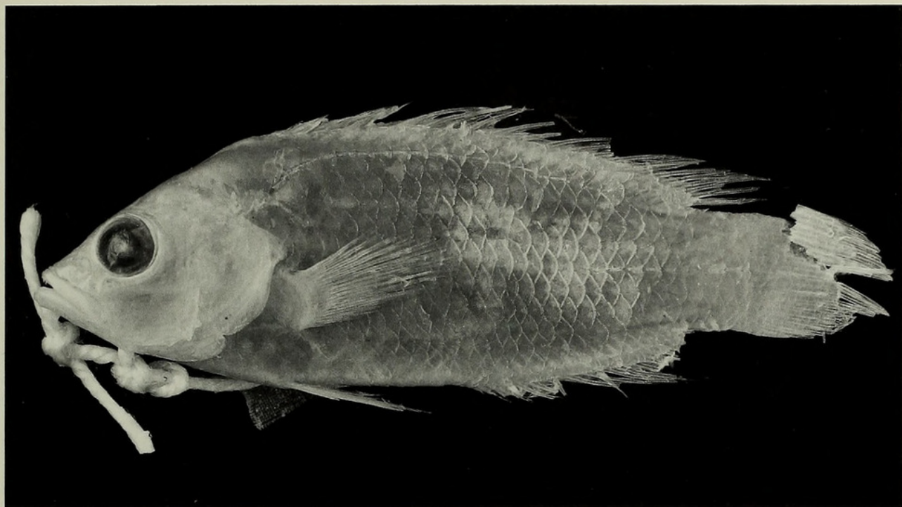
Fig. 1. Pholidochromis cerasina , USNM 136954, 43.9 mm SL, holotype, Talisei Island, Sulawesi, Indonesia.

2003:000, fig. 5 (description and distribution in part).