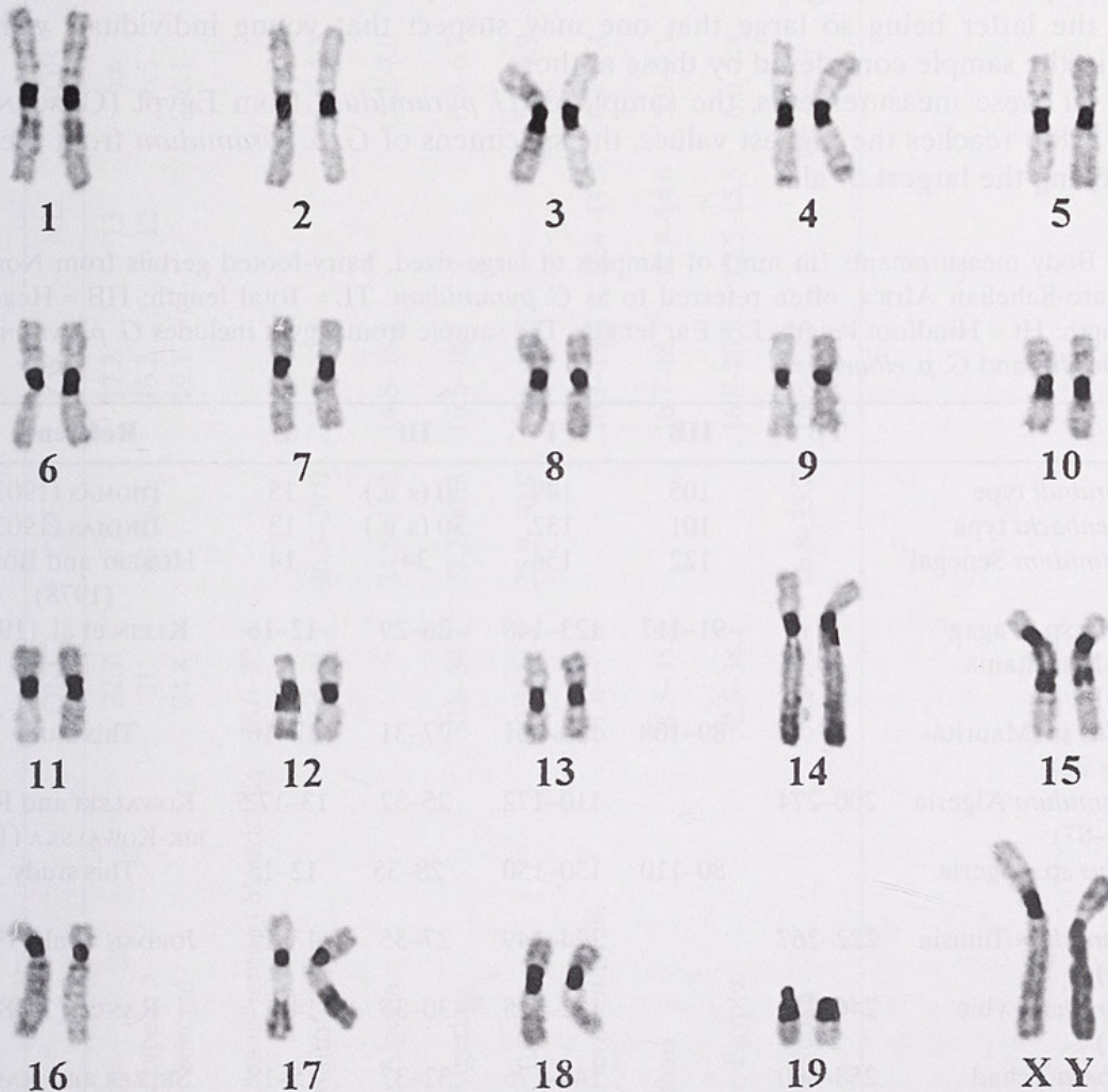
Fig. 2. C-banded (CBG) karyotype of male G. tarabuli . Note that the late replicating segments of the Fig. 1 are C-band positive.

After R-banding, the karyotypes of the six specimens from Mauritania and the two specimens from Algeria were found to be identical. They consist of 40 chromosomes comprising 13 pairs of metacentric, 5 pairs of submeta- to subtelocentric and one pair of acrocentric chromosomes, resulting in a number of autosomal arms (NFa) of 74. Both sex chromosomes are large submetacentrics, the X chromosome being the largest of the set and the Y chromosome being equal in size to the second pair of autosomes. Their short arms are identical and result from an autosome-gonosome translocation (Fig. 1). In spite of the important quantity of C heterochromatin revealed in all centromeric and some intercalary regions (Fig. 2), no well-defined heteromorphism for C-band positive heterochromatin was observed.