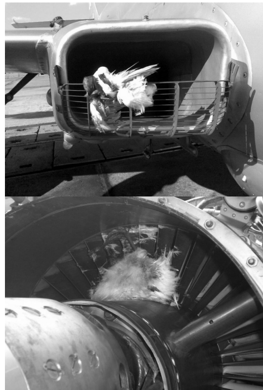
Fig. 2 Bird strike to jet trainer aircraft - TS-11 Iskra

selection of the method depending on the bird species. Therefore, the above-mentioned principles ought to be taken into consideration in the planning of preventive activities.