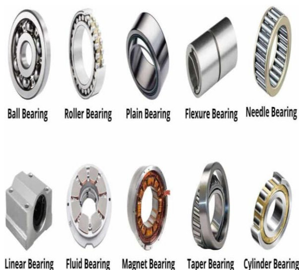
Figure 2: Types of Bearings