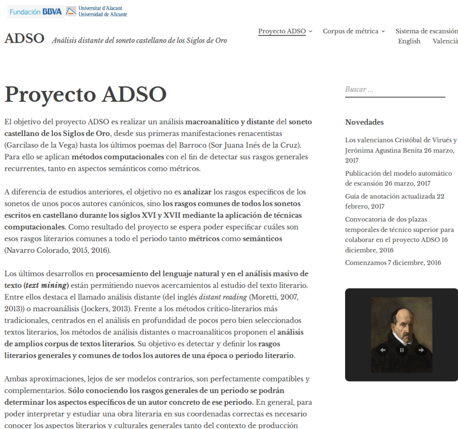
Fig. 1: Website of the project.

Spanish Literature like Cervantes, Lope, Quevedo, Tirso, Calderón, Góngora, etc. The sonnet represents one of the most important lyric genres of this period.