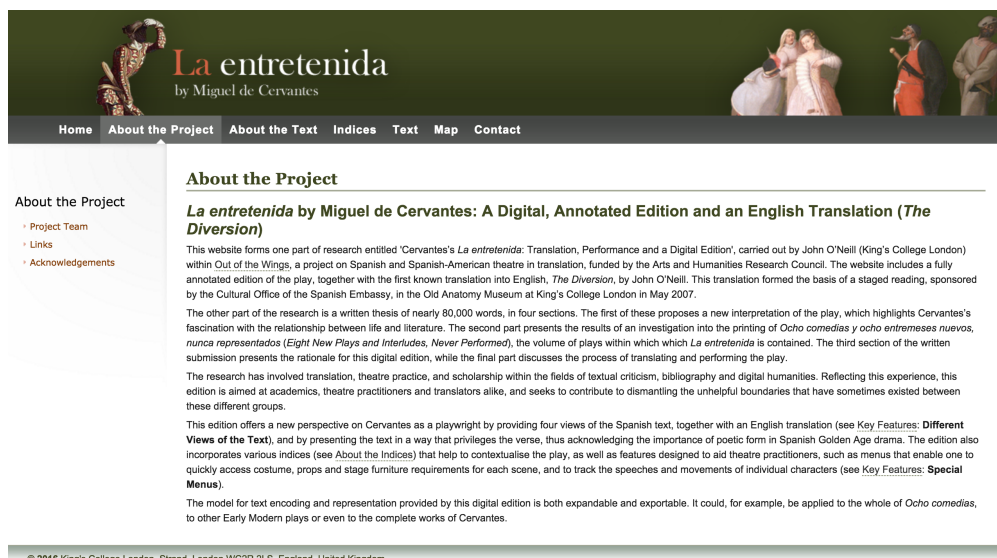
Fig. 2: About the Project.

13 Taking a closer look at the website, the ‘About the Project’ section offers detailed information about the implementation of the project and the team involved. It also offers a very useful series of links about different topics pertaining to Cervantes, Early Modern Spanish and English Theatre projects, as well as Digital Humanities and text encoding. This section increases its value with its insight into pedagogical approaches to text and to the period. It could benefit even more, however, if it contained more information about the context of the plays and their meaning in the milieu of Cervantes’s world. The integration of the dissertation into the website would have increased the effectiveness as a scholarly resource and helped shed light on some scholarly questions, such as why the number ‘eight’ in the compilation, if there is a driving topic or a literary coherence within the plays and the interludes, and whether or not Cervantes was aware that he went against the flow with his drama.