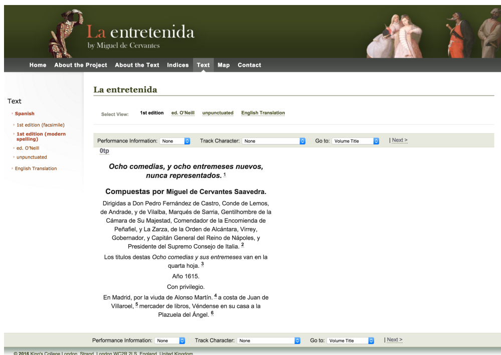
Fig. 4: The Edition.

19 There is, however, a point that, from an ecdotal point of view, could be put under revision: the use of square brackets for a set of heterogeneous phenomenology. This solution is indeed used to indicate the source errors regarding typographical misspellings or errors in the cast list, as well as to point out damage or missing texts. In addition, the brackets are also used to mark the text supplied by the editor 9 , and to add additional stage directions considered useful for the performance (asides) and track the movements of the characters, such as entrances and exits. In general, these kinds of interventions are accompanied by a note, but at first glance the typographical solution can indeed lead to confusing interpretations of the text, and it could be replaced by other more convincing digital solutions.