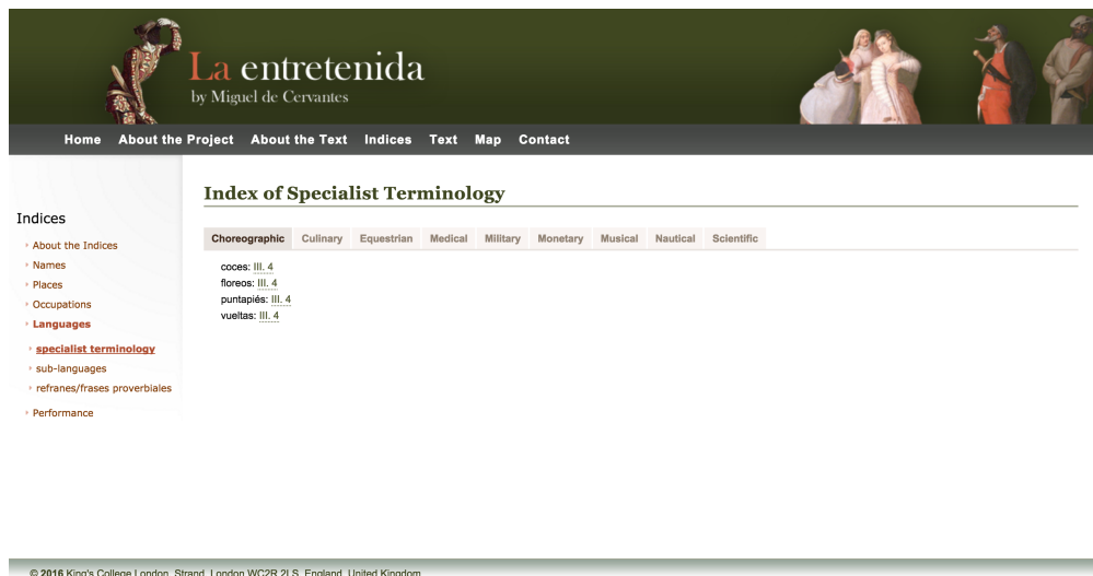
Fig. 5: Index of Specialist Terminology.

24 The indices contain different lists of items, for instance, the Names index offers a list of names present in the play that contain contextual, historical, literary, mythological, political, or religious terms. There is also a Places index structured by ‘Bloc’ (New World or Europe), ‘Country’ (Bolivia, Italy, Peru and Spain), ‘Settlement’ (Madrid or Rome) or ‘Building’. In addition, we can find a list of occupations, always linked to the text through a reference. Yet, definitely, the most interesting indices are ‘Language’ and ‘Performance’, which include an invaluable amount of terms regarding sociological topics like culinary, medical, or nautical terminology, and also provides the user with concrete elements on the performance, such as the costumes or the furniture cogitated by Cervantes himself. In this sense, some of these terms could have deserved a picture or a brief definition, since not always the term is transparent to the modern reader. However, the modern scholar can guess as to how powerful it would be to have all of Cervantes’s works arranged in this way.