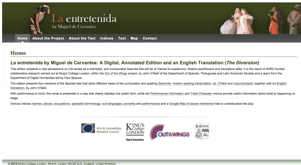
Fig. 1: Homepage.

6 The two main goals of this edition are: on one hand, to offer a new perspective on Cervantes as a playwright of comedies, as well as a new and updated version of the play to be better understood nowadays and performed; on the other hand, to present a multidimensional approach to the text while proposing different editorial versions and an English translation. Moreover, the edition's targeted audience is wide ranging, including academics, theatre practitioners, and translators.