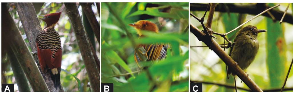
Figure 3. Three endemic species from the Inambari center associated with patches of Guadua bamboo recorded in the Humaitá Forest Reserve, Acre, Brazil. (A) Rufous-headed Woodpecker Celeus spectabilis (David P. Guimarães). (B) Rufous Twistwing Cnipodectes superrufus (Tomaz N. de Melo). (C) Acre Tody-Tyrant Hemitriccus cohnhafti (Ricardo Plácido).