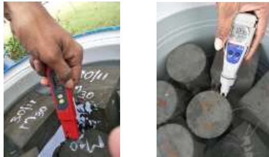
Figure showing the monitoring of pH of curing water