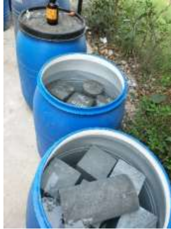
Figure showing the curing process