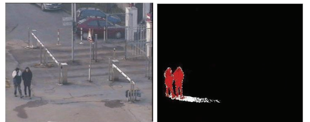
Figure 2. (a) Original video frame (b) Detected moving objects and shadow regions from ‘‘Campus’’ video

The video sequence ‘‘Campus’’ (Figure 2a) has very low shadow strength as well as high noise level. In Figure 2b, it is clearly seen that two moving objects are detected perfectly and most of the moving shadow points on the ground are successfully marked. Similarly, the algorithm is applied to other video sequences having different properties in the test benchmark and it is seen that moving object points and moving shadow points’ classification is successfully obtained as shown in Figures 3, 4 and 5.