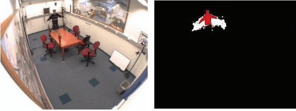
Figure 4. (a) Original video frame (b) Detected moving object and shadow regions from "Intelligent room" video