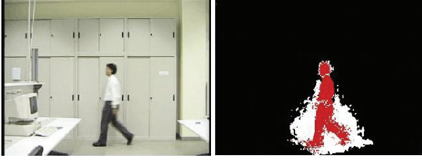
Figure 3. (a) Original video frame (b) Detected moving object and shadow regions from "Laboratory" video