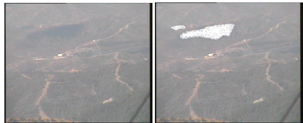
Figure 1. The source of the shadow regions are the moving clouds

moving shadow pixels and object pixels merge into a single blob causing distortions of the object shape and model. Thus, the object shape is falsified and the geometrical properties of the object are adversely affected by shadows. As a result of this, some applications, such as classification and assessment of moving object position (normally given by the centroid shape), give erroneous results. For example, shadow detection is of utmost importance in forest fire detection applications [1] because shadows are confused with smoke regions as shown in Figure 1. Another problem arises when shadows of two or more close objects create false adjacency between different moving objects resulting in the detection of a single combined moving blob. It is also well-known that shadow regions retain underlying texture, surface pattern, colour and edges in images.