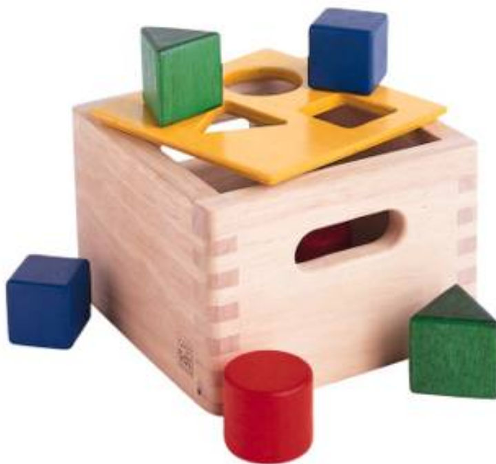
Figure 2.2: Box and blocks analogy from childhood memory: the holes on one end correspond to input templates, the holes on the other end correspond to output templates. Imagine blocks going in through one and out through the other. The blocks themselves correspond to input or output files with attached metadata . Profiles describe how one or more input blocks are transformed into output blocks, which may differ in type and number. Granted, I am stretching the analogy here; your childhood toy did not have this magic feature of course!

what kind of output goes out: this results in a deterministic and thus predictable webservice. It is also necessary to define exactly how the output metadata is based on the input metadata, if that is the case. These definitions are made in so-called profiles . A profile defines input templates and output templates . The input templates and output template can be seen as “slots” for certain filetypes and metadata. An analogy from childhood memory may facilitate understanding this, as shown and explained in Figure 2.2.