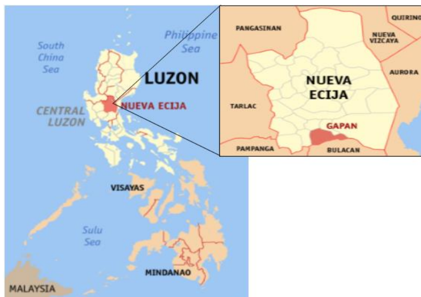
Figure 1: Location of Gapan City.

The study locale is the Division of Gapan City, one of the school's divisions of the Department of Education Region III, Philippines [8]. It is composed of 41 public schools, 33 of which are elementary schools and the 8 are secondary schools. As of July 2017, it is composed of 41,386 students [9] and 1,086 employees [10].