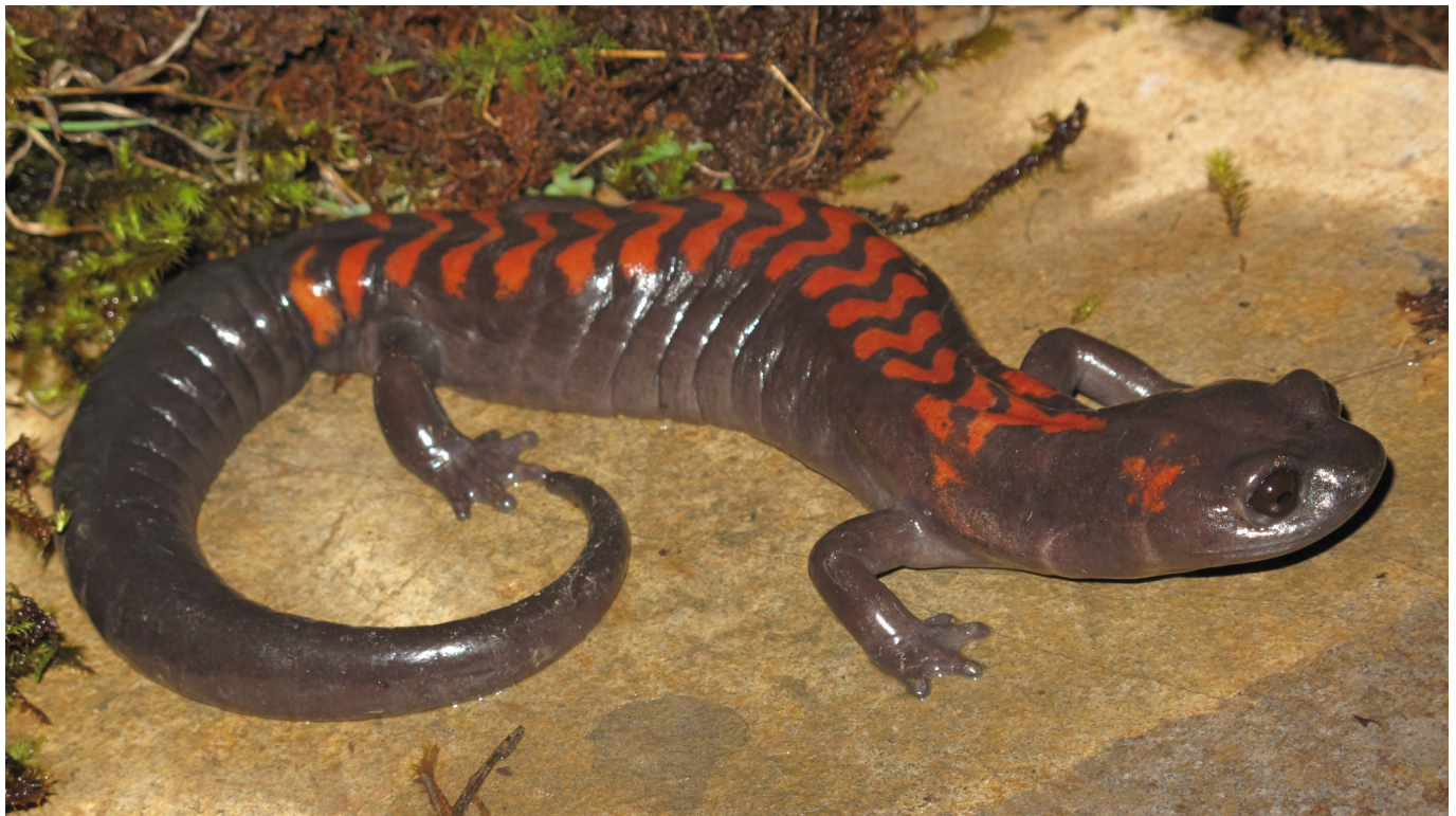
Figure 2. Female Pseudoeurycea gigantea from Tepehuacán de Guerrero, Hidalgo.