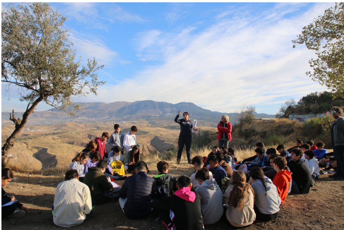
1. Educational activity about the traditional irrigation systems

3. Most of the pilot projects have in common the objective of creating new visitor itineraries that make it possible to discover the resources of a territory along a route (most of the time using soft means of transport).