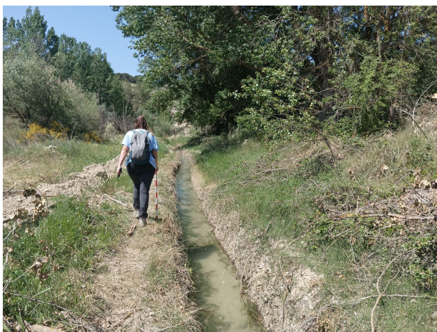
4. Field work in Castril(Image: Celia López)