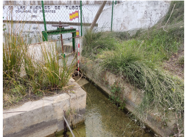
3.Two interest points: water mill and irrigation channel in Fuente de Tubos

5. The participatory heritage inventory and the participatory design of itineraries also seem to be vectors considered relevant by all the partners. It would therefore be useful to better share tools/methods to facilitate this mode of participation: importance of field surveys, availability of digital tools for collecting and sharing information.