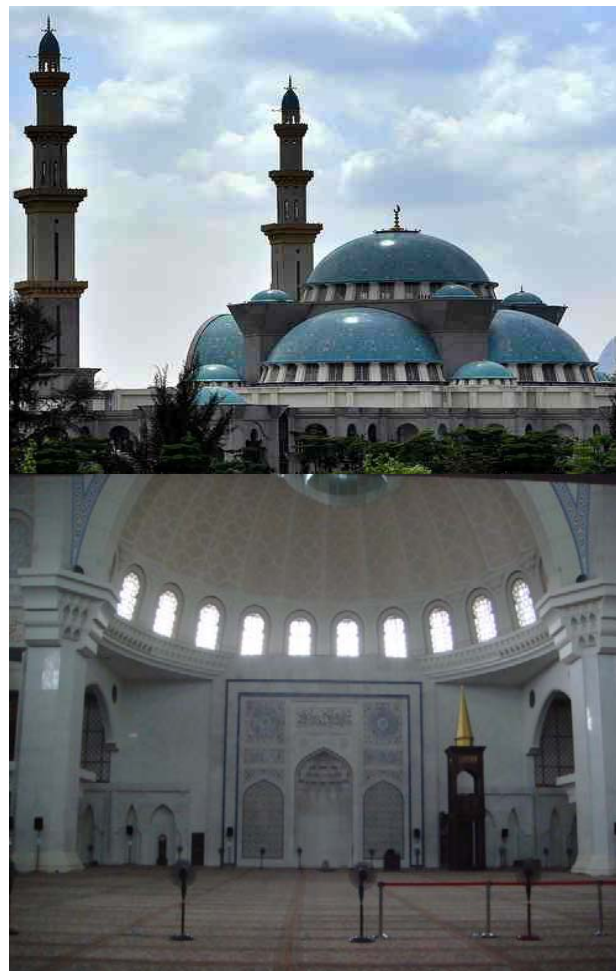
Fig. 4 Exterior (Top) and Interior (Bottom) of Masjid Wilayah

subjects of the conducted semi-structured interviews were as the following: Engagement, Familiarity, Emotional attachment, Functional attachment, Socio-cultural attachment. In terms of data analysis, they articulated the collected data into three categories namely, physical feature, activities, and meanings, then dividing these three categories into codes and subcategories. Therefore, conducting qualitative content data analysis, Najafi and Shariff [48] sought for development of the aforementioned three headlines and their subcategories into key indicators of the study reported in this paper.