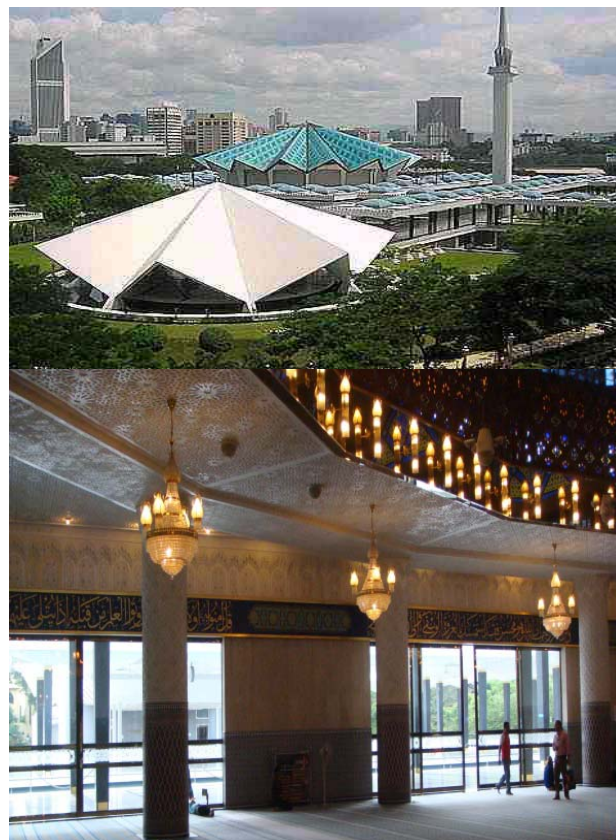
Fig. 2 Exterior (Top) and Interior (Bottom) of Masjid Negara

Sarawak State Mosque and many others are the examples of Postmodern Revivalism Architecture in Malaysia. Tajuddin [44] explained the vocabulary of this style as the use of an eclectic array of: a) Iranian or Turkish domes, b) Egyptian or Turkish Minarets, c) Persian Iwan gateways, d) lavish courtyards surrounded by the Sahn, e) an Arabian hypostyle planning composition, f) and pointed or semicircular arches bathed in sumptuous classical 'Islamic' decorations. Out of all postmodern mosques of Malaysia, this study focused on Masjid Putra in Putrajaya (Fig. 3) and Masjid Wilayah in Kuala Lumpur (Fig.4) as the representatives of this style.