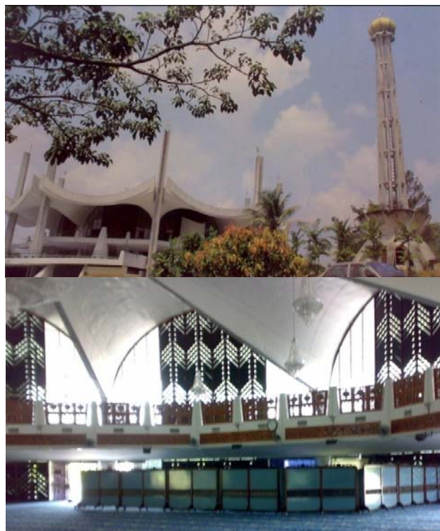
Fig. 1 Exterior (Top) and Interior (Bottom) of Masjid Negeri Sembilan