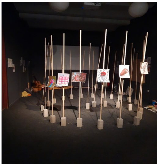
Figure 7: Students' final installation