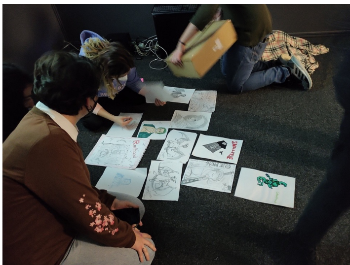
Figure 3: Preparing ‘war and peace’ materials

Finally the museum feels less like an impersonal place of highbrow art exhibits - it is impossible not to sense that something good is happening there. Yet, at some point one of the school-teachers says: “we somehow need to show to the school that we have been doing something [worthwhile] here”. The teacher needs to deliver something – to show that the time spent at the museum did lead to a creation of some kind.