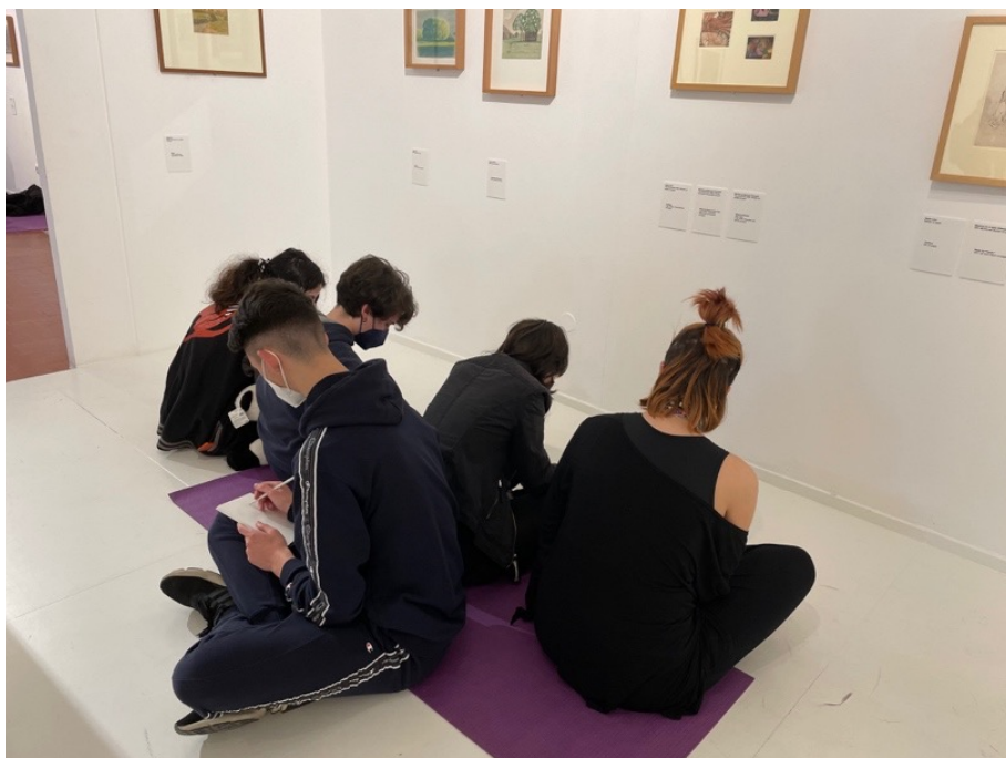
Figure 1: Copying artworks

Collective decision making about how the group might begin creative work and at the same finding their way into the museum spaces has not been easy. In the third session the students decided that they would like to see the museum exhibition - everyone gathered in one of the large exhibition rooms; an intense discussion begins as to the adoption of a guided-tour format, or, conversely, of a free-floating individual take. There are voices that insist that the absence of a guide will induce disorientation, while others say that “walking through the exhibition on our own does not equal ‘chaos’”. One of the school-teachers turns to the museum educators and says, once again: “could you please explain to us the logic of the exhibition?” The museum educators prefer to avoid answering: “maybe it is better if you take your time, walk through the exhibition and discuss its logic when you come back?”, says Vaso. The logic of ‘explanation’ and the logic of ‘exploration’ seem irreconcilable.