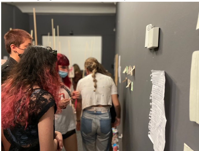
Figure 4: Sharing proposals

A few weeks later: we are in our 8th meeting; spread around in the dark room are the artworks made by the students in the context of the workshop. The group moves around the room, vividly exchanging comments about their work. At some point one of the educators utters the question whether they would like to proceed by making some music to add to their final installation. One of the students says: “But only if we want to, right?”, at which point another says: “Only if we want to, haven’t you got this yet? This is what we keep saying since the beginning of this all: ‘only if we want to’”. Letting the students feel that they indeed could express desire in the process of a museum education program, has not been easy.