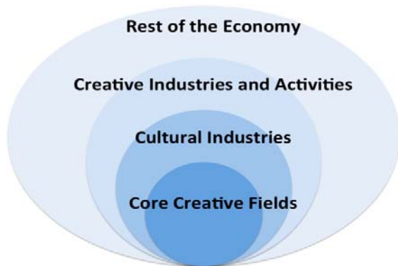
Fig. 1 Throsby concentric circles model [10]

part of the macro economy which broadly describes its “creative” part and incorporates the Arts, Artists and other creative talents as its participants, which are of particular interest for this article.