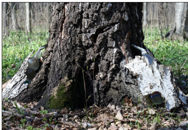
Fig. 7 Bottles covered with birch bark are protected from the sun and are more difficult to spot in the forest, Vinnytsia Oblast, 2012.

in Slovenia in the mid-20th century [141]. There are records of tapping birch-sap from the Carinthian Slovenes in neighbouring Austria from the end of 19th century [142].