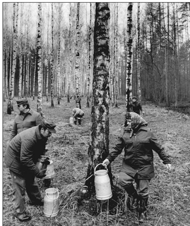
Fig. 4 Tapping birch sap in Colditz, near Leipzig, in East Germany in April 1985.

Birch ( B. pendula ) and maple sap were commonly drunk fresh by Slovaks (mainly boys) in 19th century Slovakia [111–113]. Only the Latin name of field maple ( A. campestre ) is mentioned in ethnographic sources [111,112], but sycamore ( A. pseudoplatanus ) was probably commonly used as well.