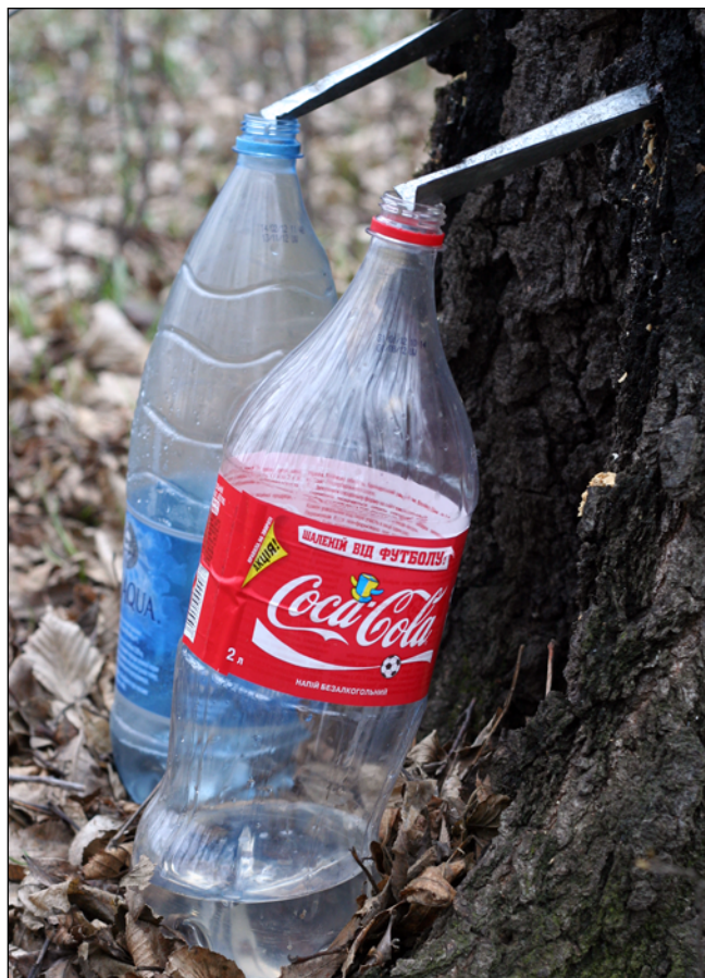
Fig. 5 All over Ukraine birch sap is collected into reused plastic bottles, Vinnytsia Oblast, 2012.

Nobleman Johann Weikhard von Valvasor describes in his famous “Die Ehre deß Hertzogthums Crain” [140] from Carniola that a healthy beverage was made of the birch sap. Birch sap was still gathered around Logatec in Inner Carniola