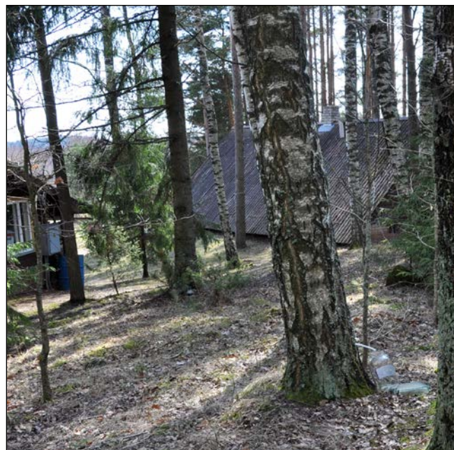
Fig. 1 Birch sap is preferably collected on the hills, often near homesteads. Kambja, Tartu County, Estonia, in 2012.

Starting from 1972, centralized collection of birch sap was organized through state forest enterprises (Fig. 2). The plans for collecting were fixed, the quality standards for chemical and physical qualities were established, the techniques of collection changed, and opened containers were replaced by relatively hermetic collecting [79]. Two food-factories stocked up and processed sap, adding bog cranberry ( Vaccinium oxycoccos L.) or quince [ Chaenomeles spp.] juice, as well as sugar, and sold it in the shops [12,80]. In addition, the birch sap was used to produce shampoo. Over 30 tons of birch sap were collected in 1976 for that purpose [12]. In modern Estonia a few men of enterprise have found use for larger amounts of semi-industrially gathered birch sap in the form of the birch vodka “Kaseviin” and birch wine; also fresh birch sap is sold locally or exported to Italy [81].