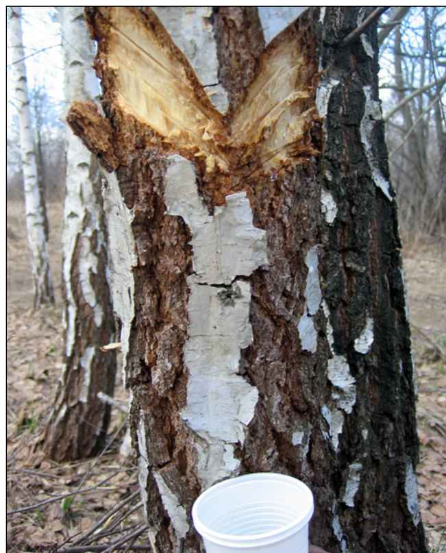
Fig. 8 Collecting birch sap in a Romanian forest.

Birch sap was drunk as a refreshment, and it was also considered an appetizer. It was taken against stomach and lung illnesses, women used it as a cosmetic, especially against freckles. Vinegar and beer was brewed, wine was fermented from sap [147]. Birch sap was also used for coagulating milk