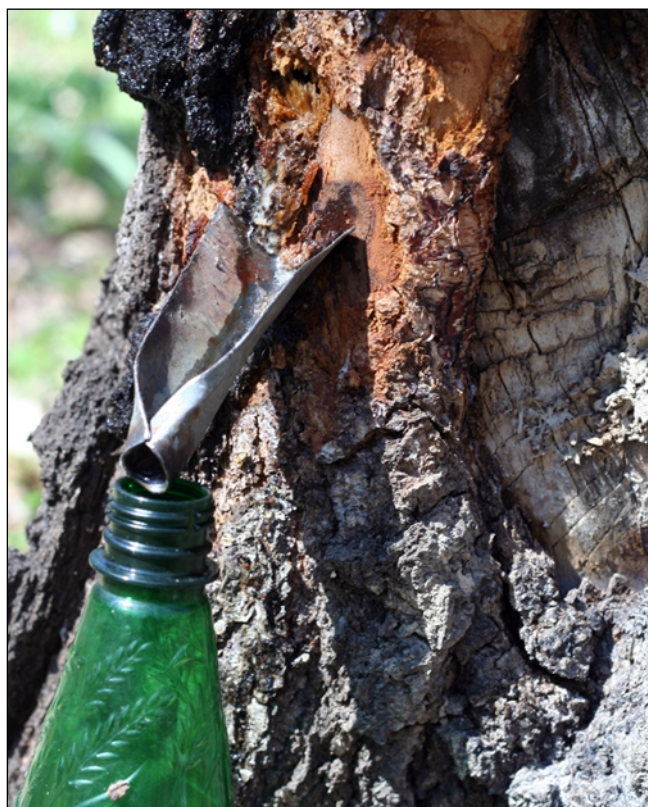
Fig. 6 V-shaped metal spout used in Ukraine, Vinnytsia Oblast, 2012.