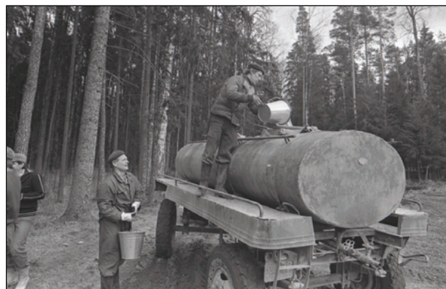
Fig. 2 Collecting of birch sap for the food industry in the early 1990s, the last years of Soviet regime, Tiksoja, Tartu County, Estonia.

The main means of preserving birch sap was through alcoholic fermentation. Besides the plain sour drink that was kept for months in the cellar and used during hay-making, different drinks were produced, like kvass (light ale), beer, and mead. For the fermentation, different additives were used, like twigs of black currant ( Ribes nigrum L.) and juniper ( Juniperus communis L.), caraway fruits ( Carum carvi L.); and later also