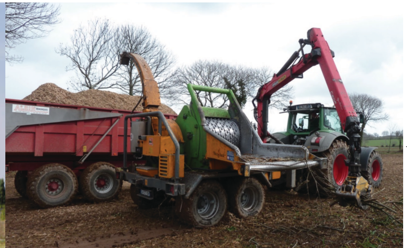
Shredding branches after the pruning of a hedge.