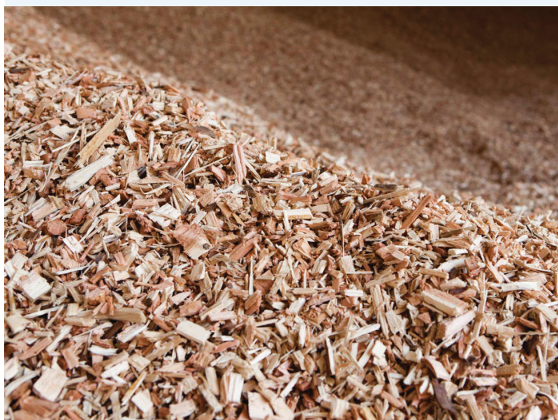
An open-air warehouse for woodchip storage.