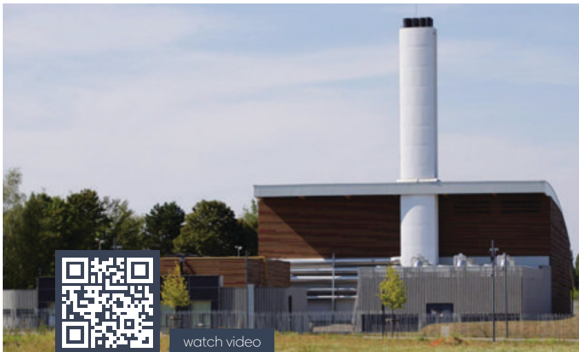
A collective heating facility using woodchips in Sin-le-Noble, France, supplying heating to apartment buildings, a school, a high-school, a hospital and even a shopping mall.

A serious lead for the valorisation of hedge products is wood-fuel for collective heating systems. Several actions are needed to truly develop a wood-fuel value chain: promote hedge restoration and replanting, train farmers on good hedge management practices, help small-scale woodchip-processing companies to find suppliers and promote installation of heating systems for city infrastructures, enterprises or farms.